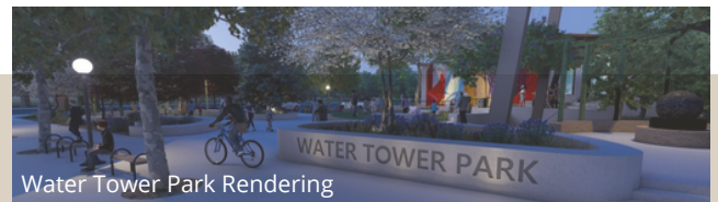
Water Tower Park Rendering