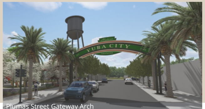
Plumas Street Gateway Arch